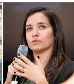
Waad Al Kateab